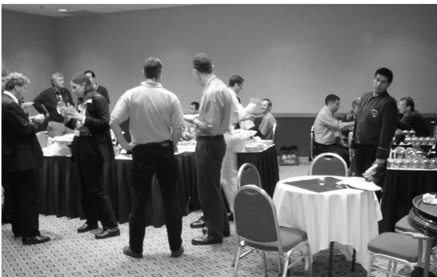
Delegates enjoying the ECVS lunch at the ACVS meeting in Denver